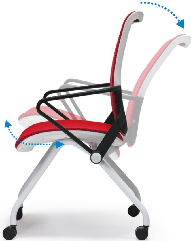
Human engineering concept Synchro